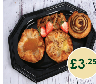
DANISH PASTRY PLATTER

Breakfast Muffin, Banana, Maple Pecan Danish Pastry, Croissant, Jam and Butter Portion, Fruit Garnish